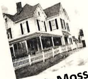
Historic Moss Home Tour